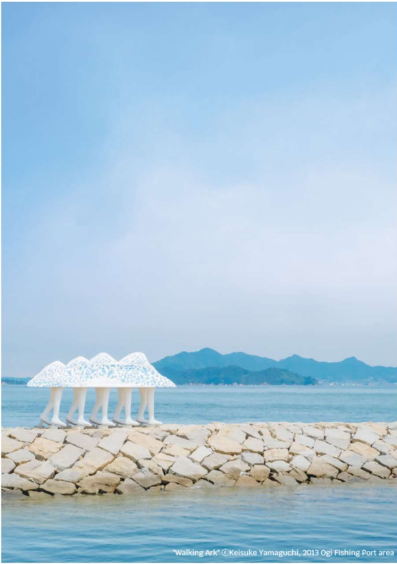
"Walking Ark" ©Keisuke Yamaguchi, 2013 Ogi Fishing Port area