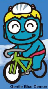
Gentle Blue Demon