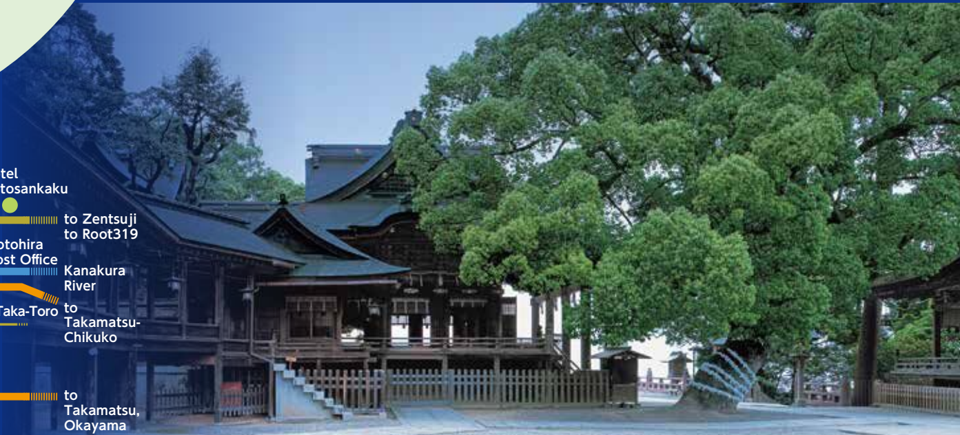
Gohon-Gu (main shrine)

The top picture is "Member of Sanuki-in, a figure to save Tametomo". A painting by Kuniyoshi Utagawa an Ukiyoe artist in late Edo period.