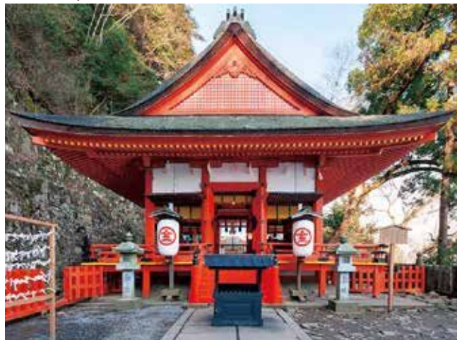
Oku-Sha (Izutama shrine)