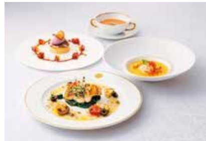
Dishes in Kamitsubaki

You'll pass the largest building on the site, Asahi-Sha, which sits on the last flat place before the steep climb up to the Gohon-Gu (main shrine).